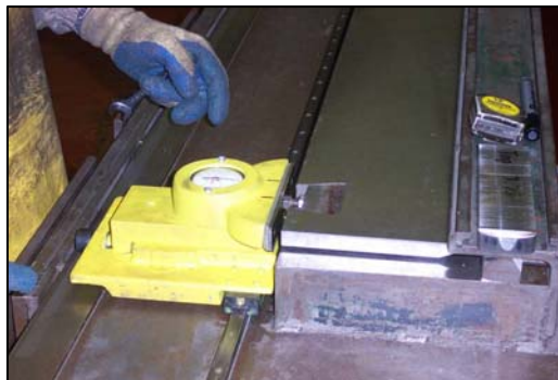
An A-P-I System in a softwood veneer application.

Once the locator bolt is adjusted out such that there are not enough treads left inside the insert to hold, simply replace the bolt with the longer set bolt. Accurate adjustments can be performed in seconds.