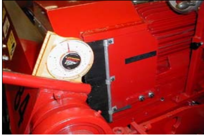
Fully adjustable Sharpness Angle

Whether you are chipping, peeling, or planing, you need an accurate knife edge to get a