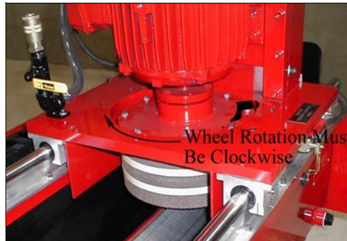
Vertical Spindle Bench Model is a full flood coolant machine and is well suited for planer or chipper knives.