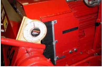
Fully adjustable Sharpness Angle for optimum knife function

Whether you are chipping, peeling, or planing, you need an accurate knife edge to get a